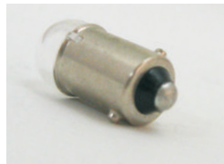
Patented anti-electrostatic design