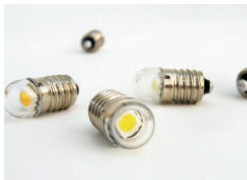
Non-glass cover offering better safety