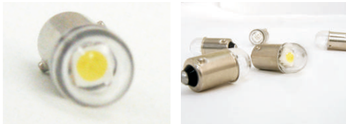
Automotive rated LED driver IC inside